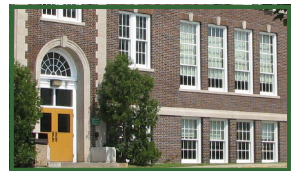
2003 - NEW WINDOWS FOR THE MAIN COMPLEX