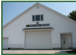
2003 - BUILDING TRADES GETS A NEW BUILDING